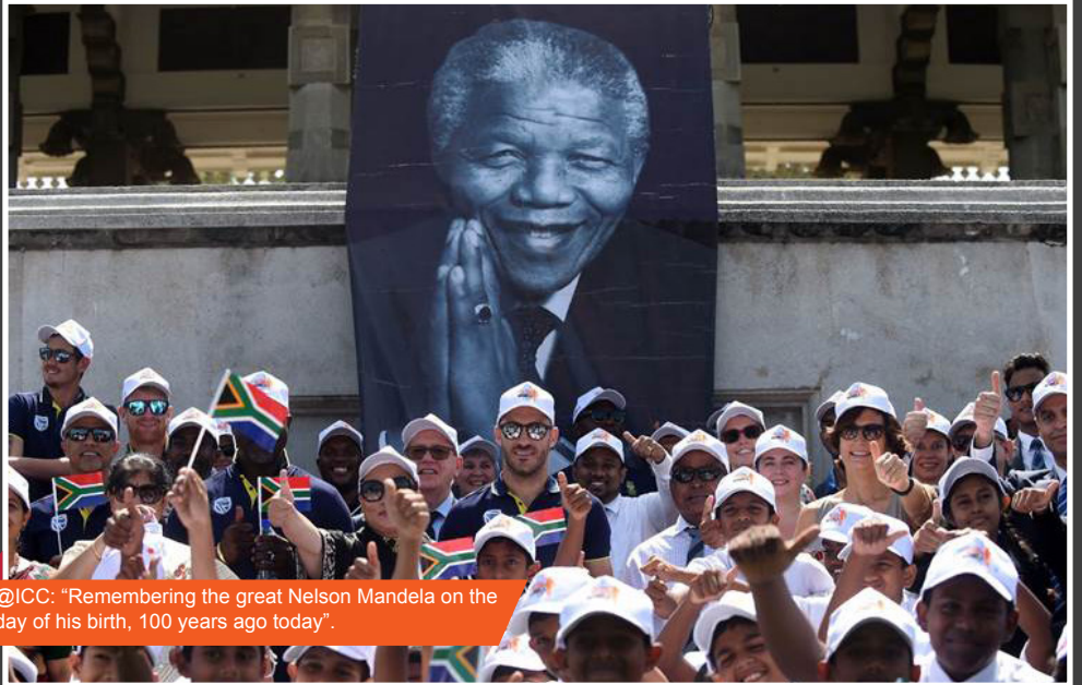
@ICC: "Remembering the great Nelson Mandela on the day of his birth, 100 years ago today".