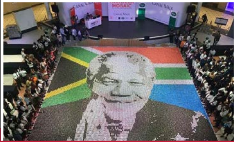
@PhaksPhothinja: "My former high school, LEAP Science and Maths School (@LEAPAfrica), used 29 000 cans of food to build a portrait of Mandela in the Food Court of Canal Walk. A teamwork celebration of this great man #MandelaDay. Food to be donated to charity".