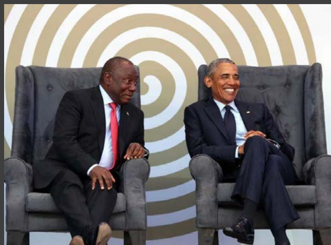
President Cyril Ramaphosa with former US President Barack Obama at the 16th Nelson Mandela Annual Lecture on 17 July 2018.

Ramaphosa said Obama, as US President, embodied many of the values and aspirations that we saw in great leaders like Mandela – humility, wisdom, compassion, the ability to inspire hope and inspire a nation to action. "Like Mandela, Obama had dedicated his life to championing the cause of the poor and pursuing justice."