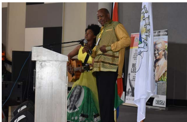
Jubilation as praise poet Mzwakhe Mbuli and Zahara share a song with the audience.