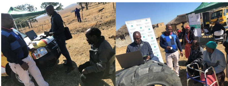
The GCIS helping some of the pensioners with the SASSA card swap on Mandela Day.