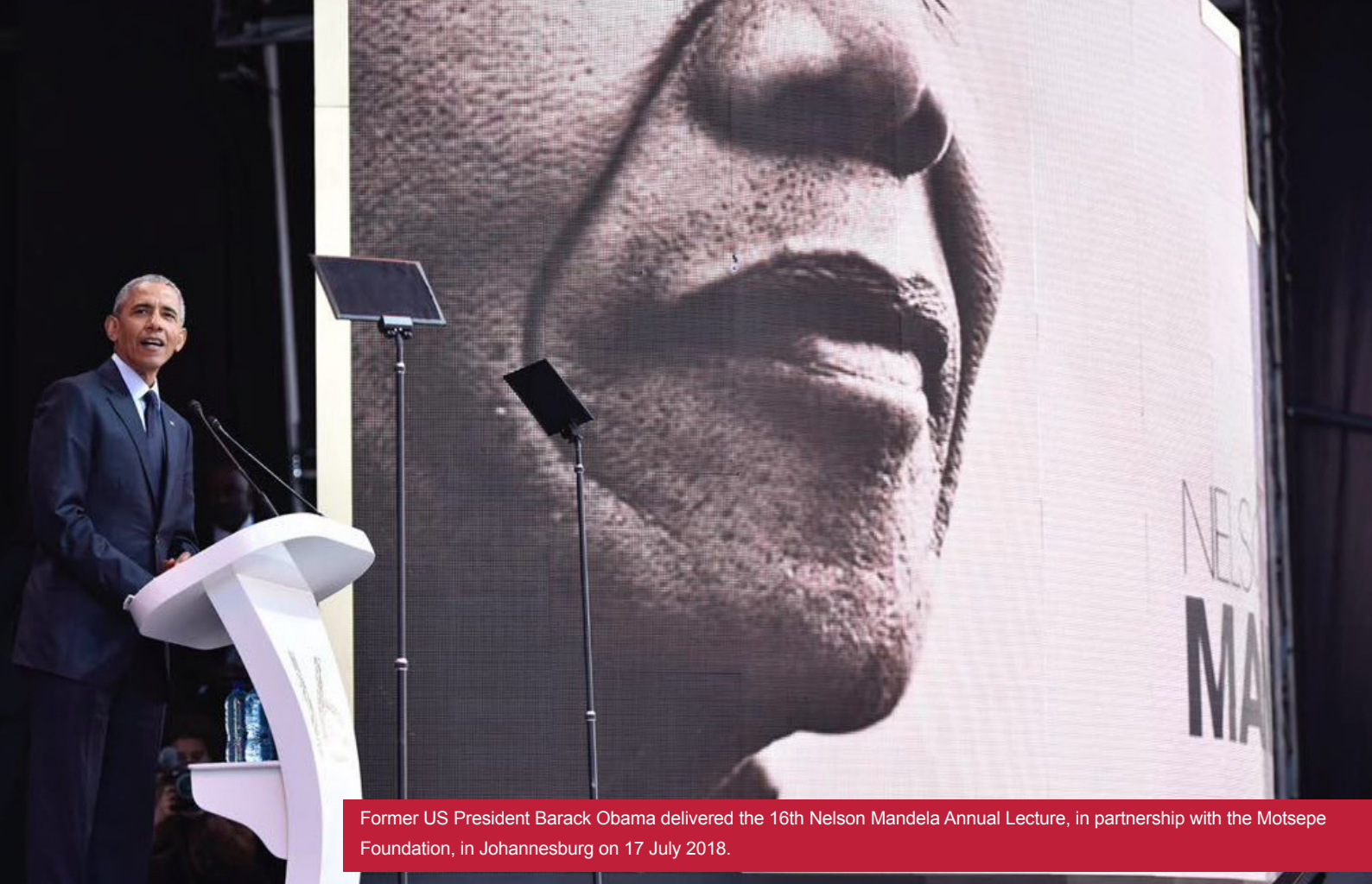
Former US President Barack Obama delivered the 16th Nelson Mandela Annual Lecture, in partnership with the Motsepe Foundation, in Johannesburg on 17 July 2018.