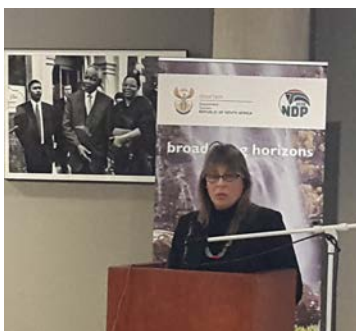
The Cuban representative giving a message of support on behalf of the Cuban Ambassador.