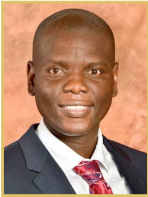
Mr RO Lamola, MP

Minister of the Department of Justice and Correctional Services