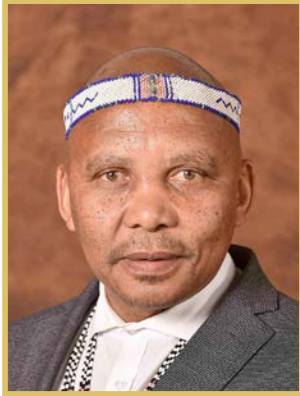
Nkosi Phathekile Holomisa, MP

Deputy Minister of the Department of Correctional Services