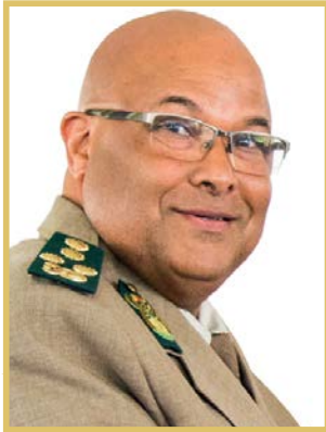
Mr A Fraser

National Commissioner: Department of Correctional Services