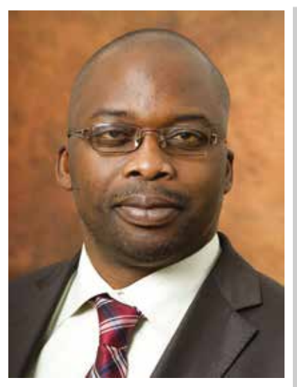
Advocate Michael Masutha Minister of Justice and Correctional Services

The National Development Plan, Vision 2030 (NDP) aims to mobilise the nation as a whole towards the realisation of a common strategy and plan. The Department of Correctional Services (DCS) is part of the Criminal Justice System that is responsive to high levels of crime which is prevalent in society, primarily with the intention of curbing crime. Taking cognisance of the fore-mentioned historical context regarding the myriad of socio-economic challenges confronting South Africa, the timing is opportune for the DCS to pro-actively and strategically plan for the next 100 years.